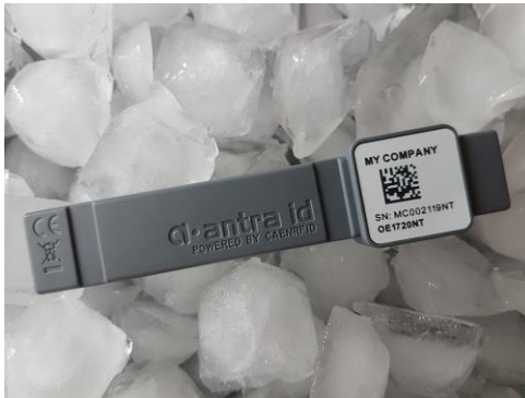
Incoming Inspection Report of Cold Material